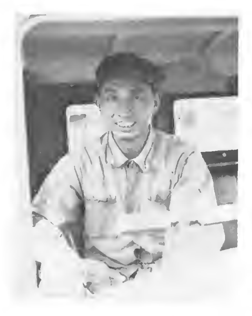
A Tractor Driver Selflessly Devoted to the People

What is more, he joined a local revolutionary rebel organization and fought shoulder to shoulder with the proletarian revolutionaries of the whole province until they had overthrown the capitalist-roaders. Today he is a member of the Standing Committee of the Revolutionary Committee of Honan province.